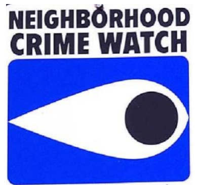
We immediately report all SUSPICIOUS PERSONS and activities to our Police Dept.